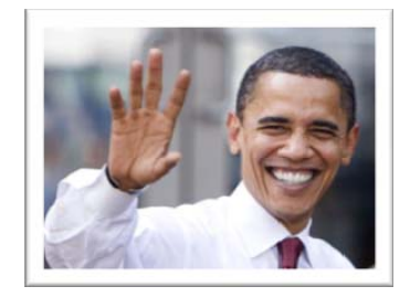
Figure 6 Barack Obama, 2008